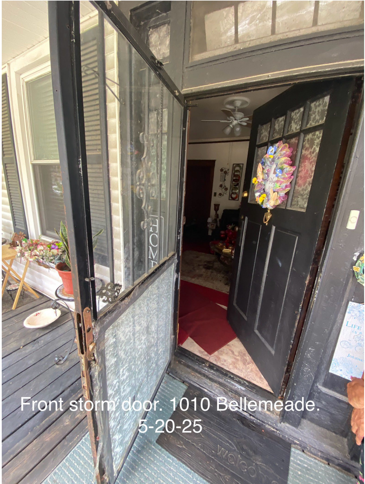
Front storm door. 1010 Bellemeade. 5-20-25

1010 Bellemeade Ave., Evansville, IN 47714