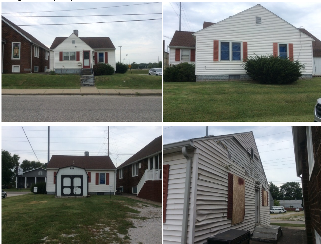
Image of Property