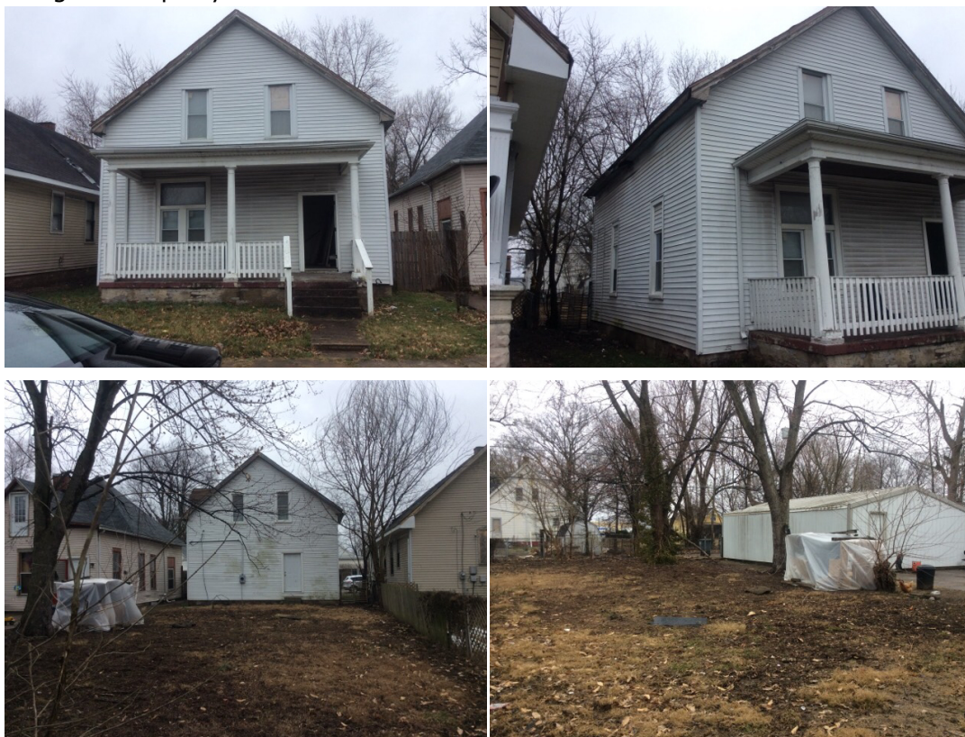
Image of Property