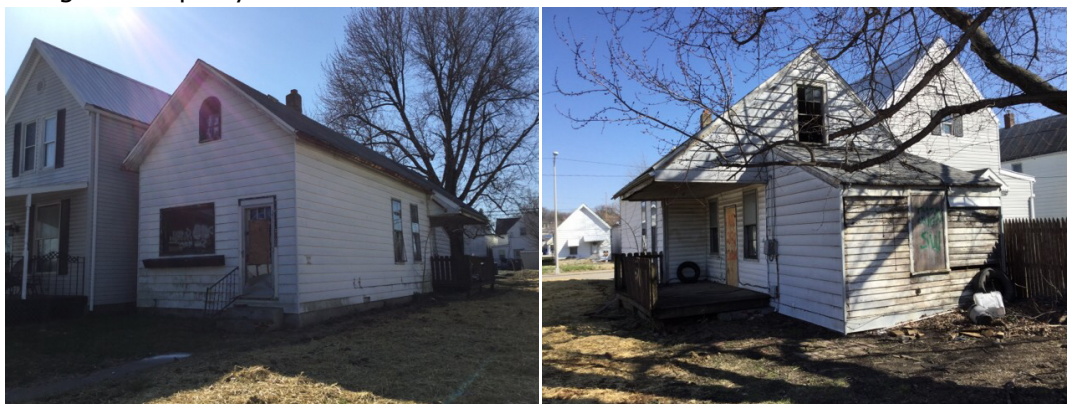
Image of Property