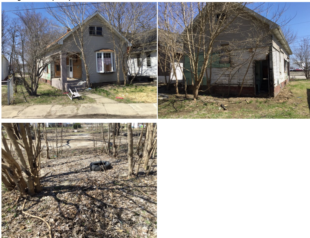
Image of Property