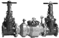
DC & DCDA