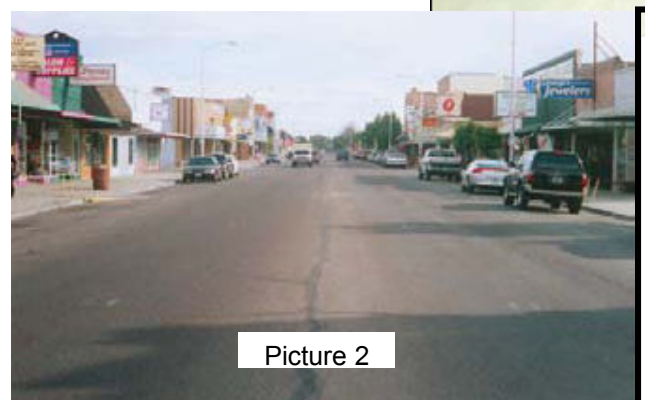
In a study of consumer preferences, Picture 1 was a more attractive shopping area, where Picture 2 was the least desired. Picture 3 was moderately attractive.