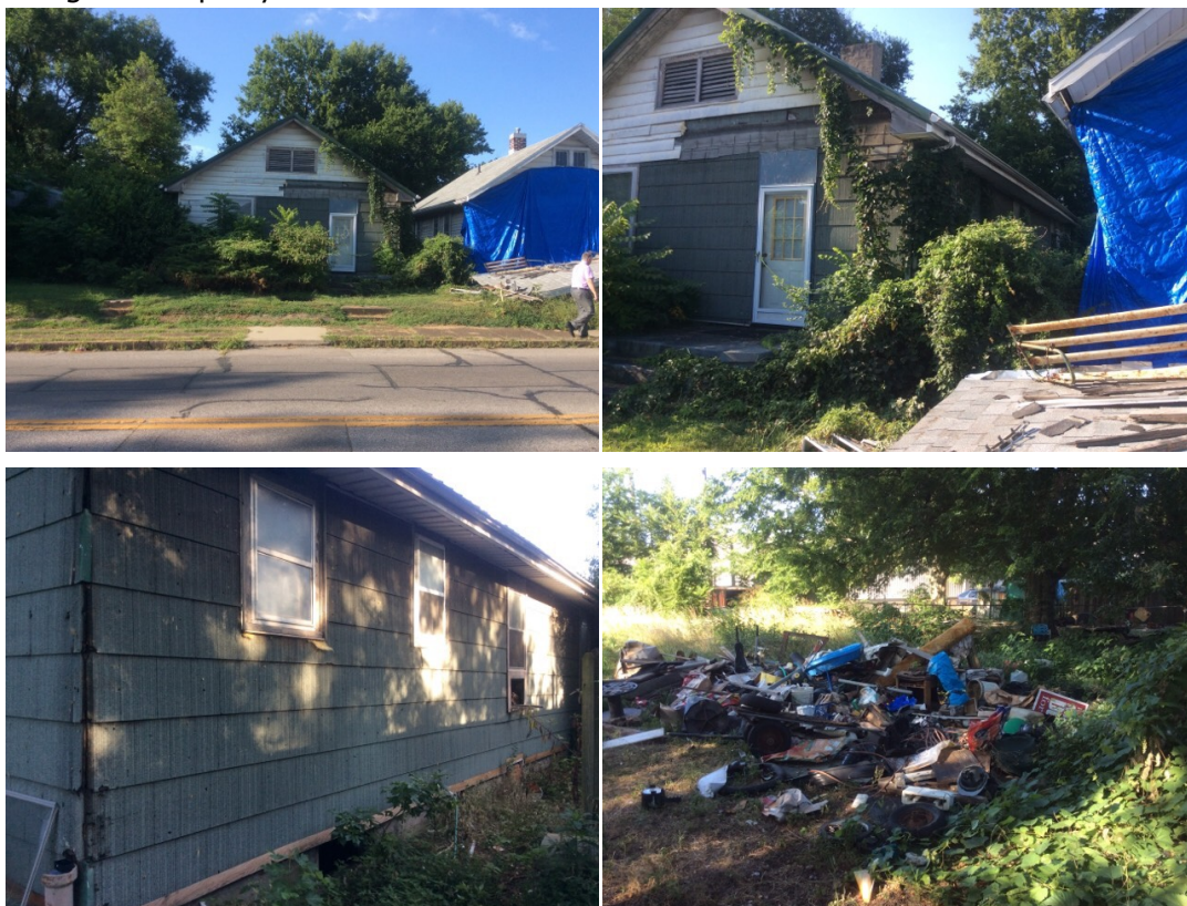
Image of Property